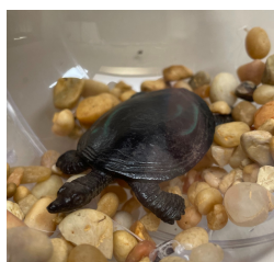
Spiny softshell turtle