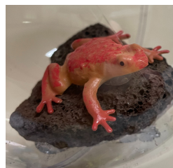
Red spotted toad