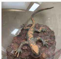
Common checkered whiptail